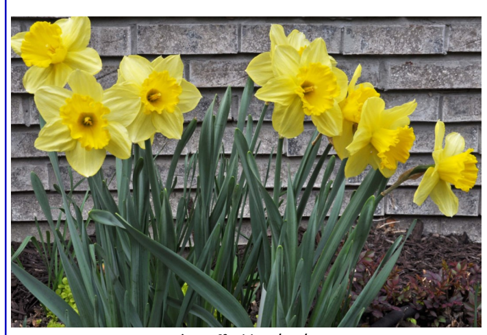
Nancy's Daffodils 4/18/2019