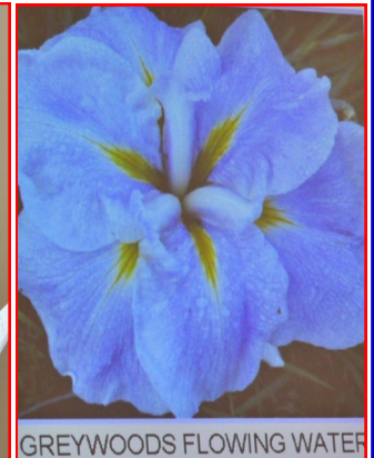
Above: Diann gives program on Iris selected for 2019